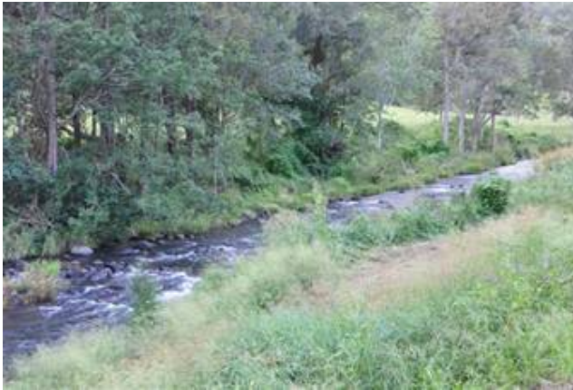
The old swimming hole